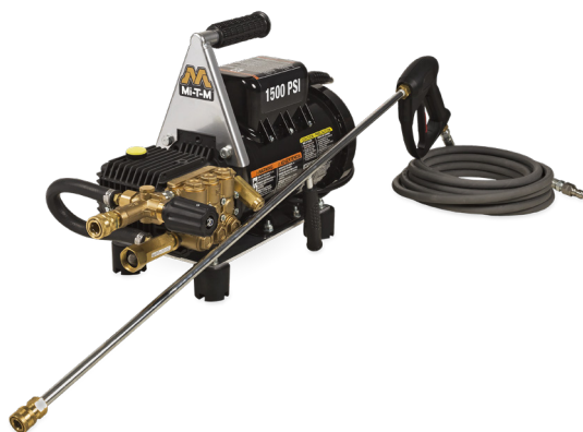
DC-1502-H0E1G (hand carry)

WARNING: Cancer and Reproductive Harm - www.P65Warnings.ca.gov .